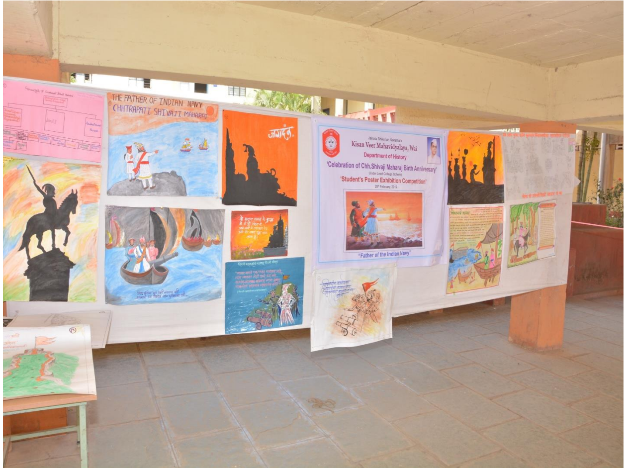
Display of Posters by Participated Students in the Competition on the 'Biographies of Chh. Shivaji Maharaj'